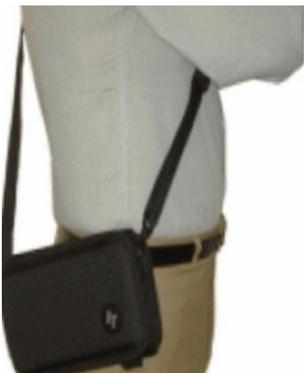
On the Shoulder Strap