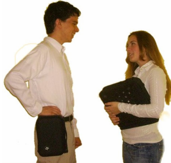
Office or Classroom