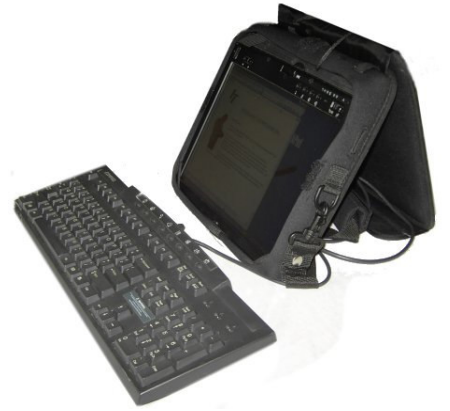
New Easel Design