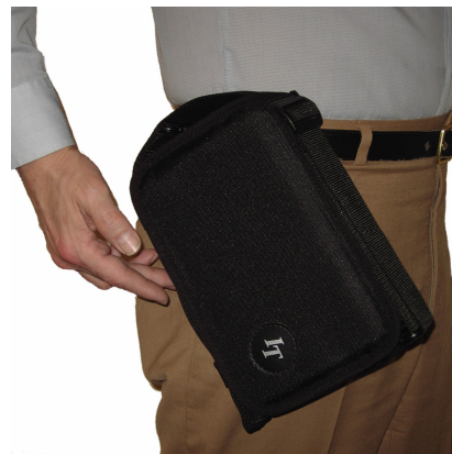
On the Belt Clip