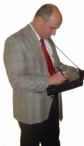
In the Office