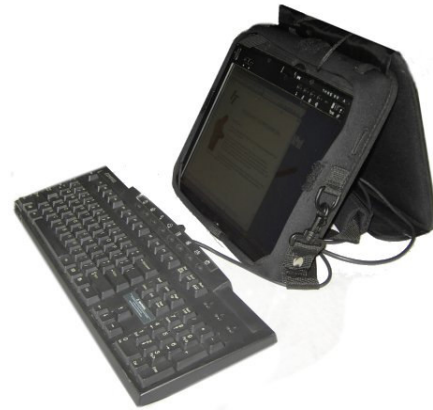
New Easel Design for Desk Top Comfort