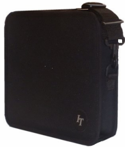
Secure the Shoulder Strap