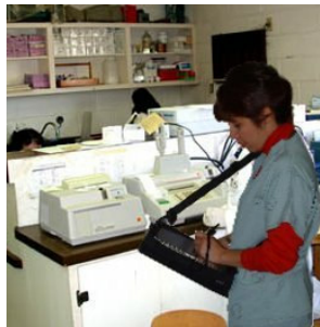
In the Lab