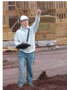
In the Field